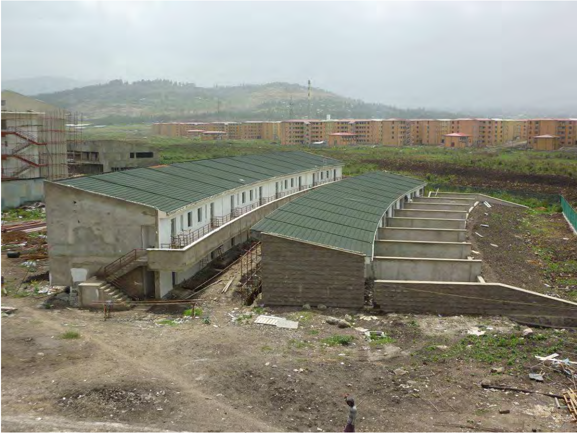
Staff residence (H), finished for 60%.