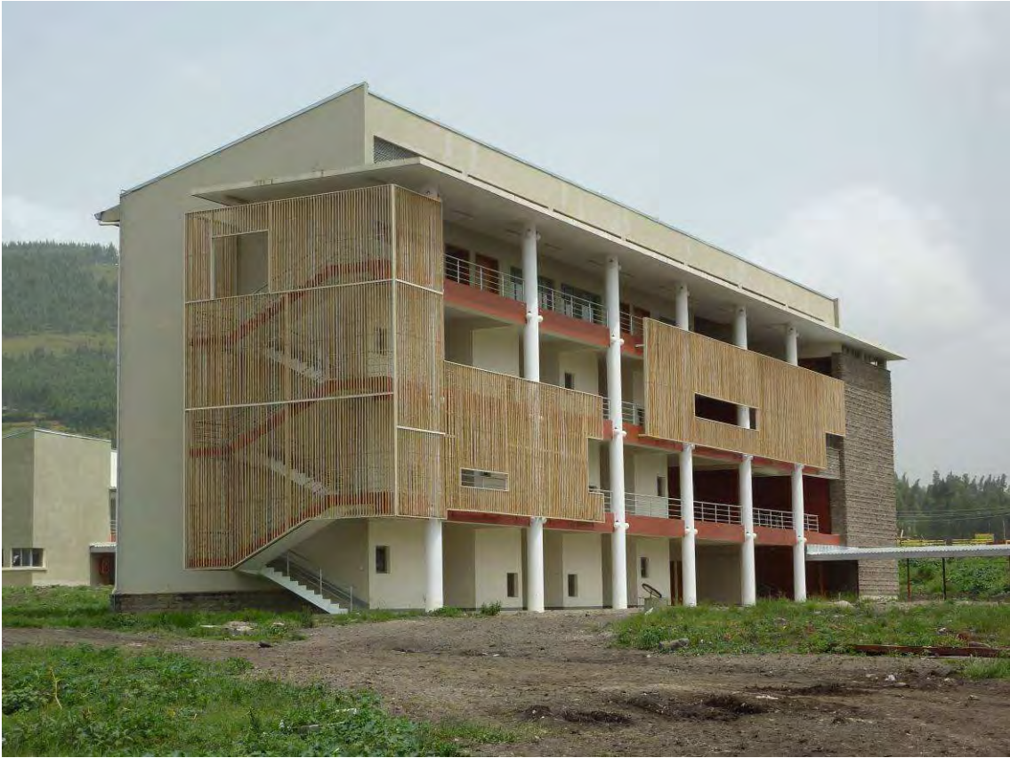
Classroom building (B), finished for 90%.