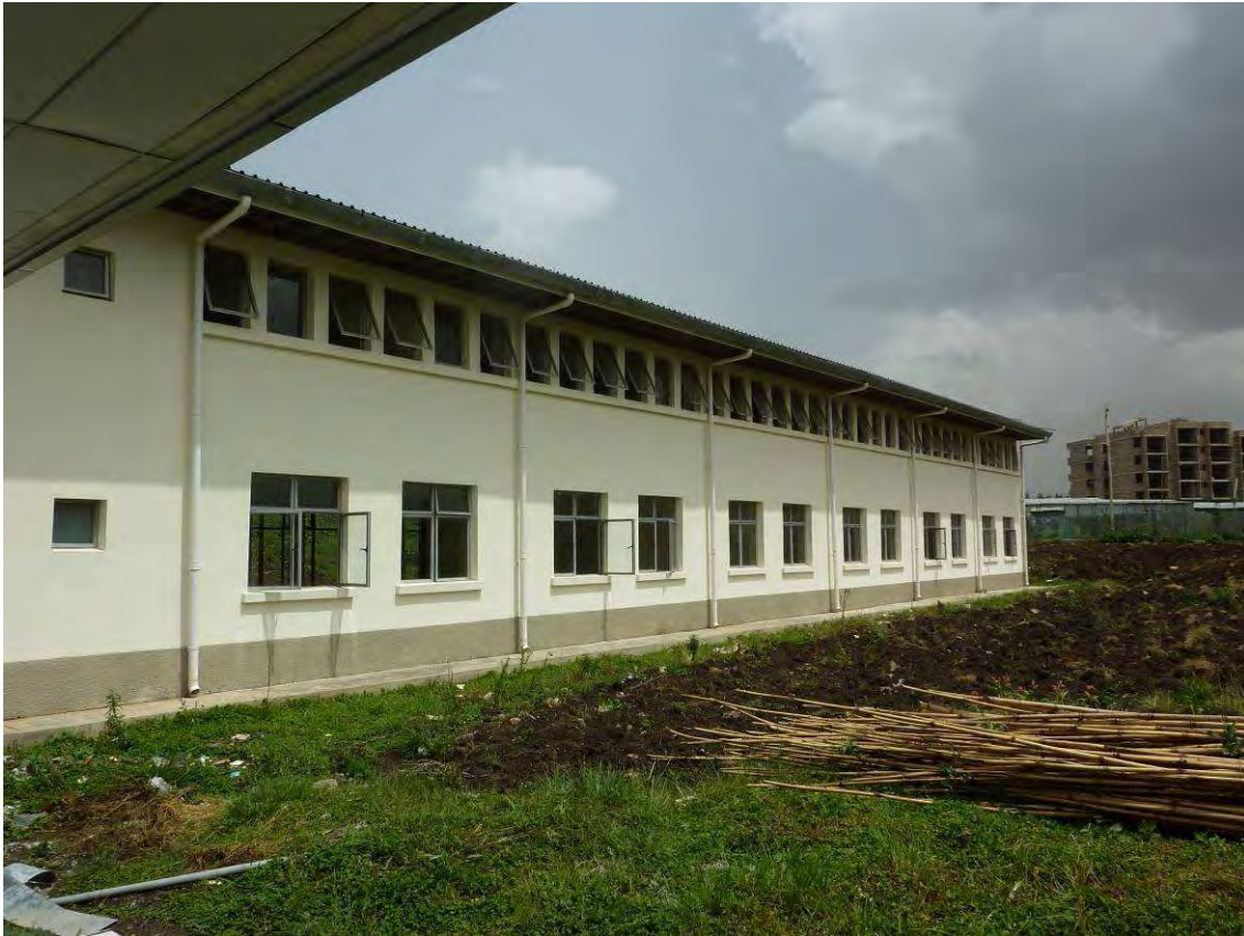
Management building (C), finished for 90%.