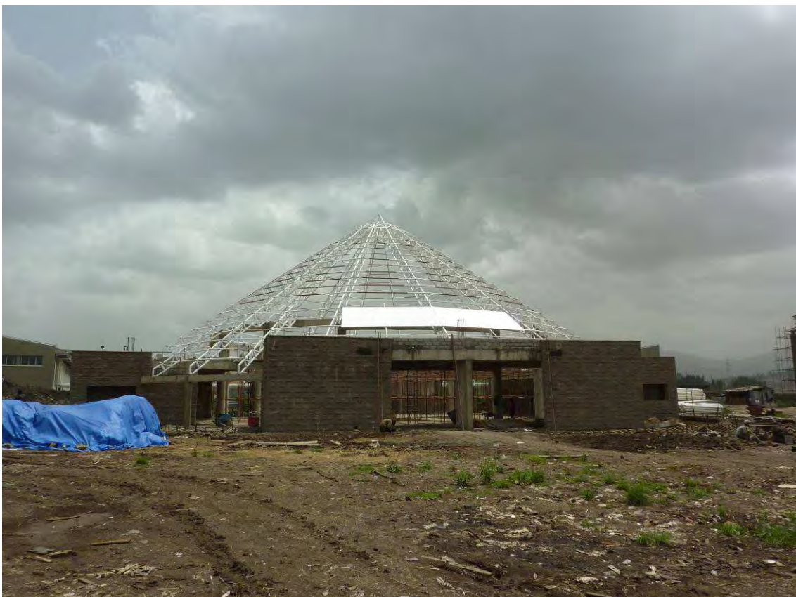
Multi purpose hall (D), finished for 40%.