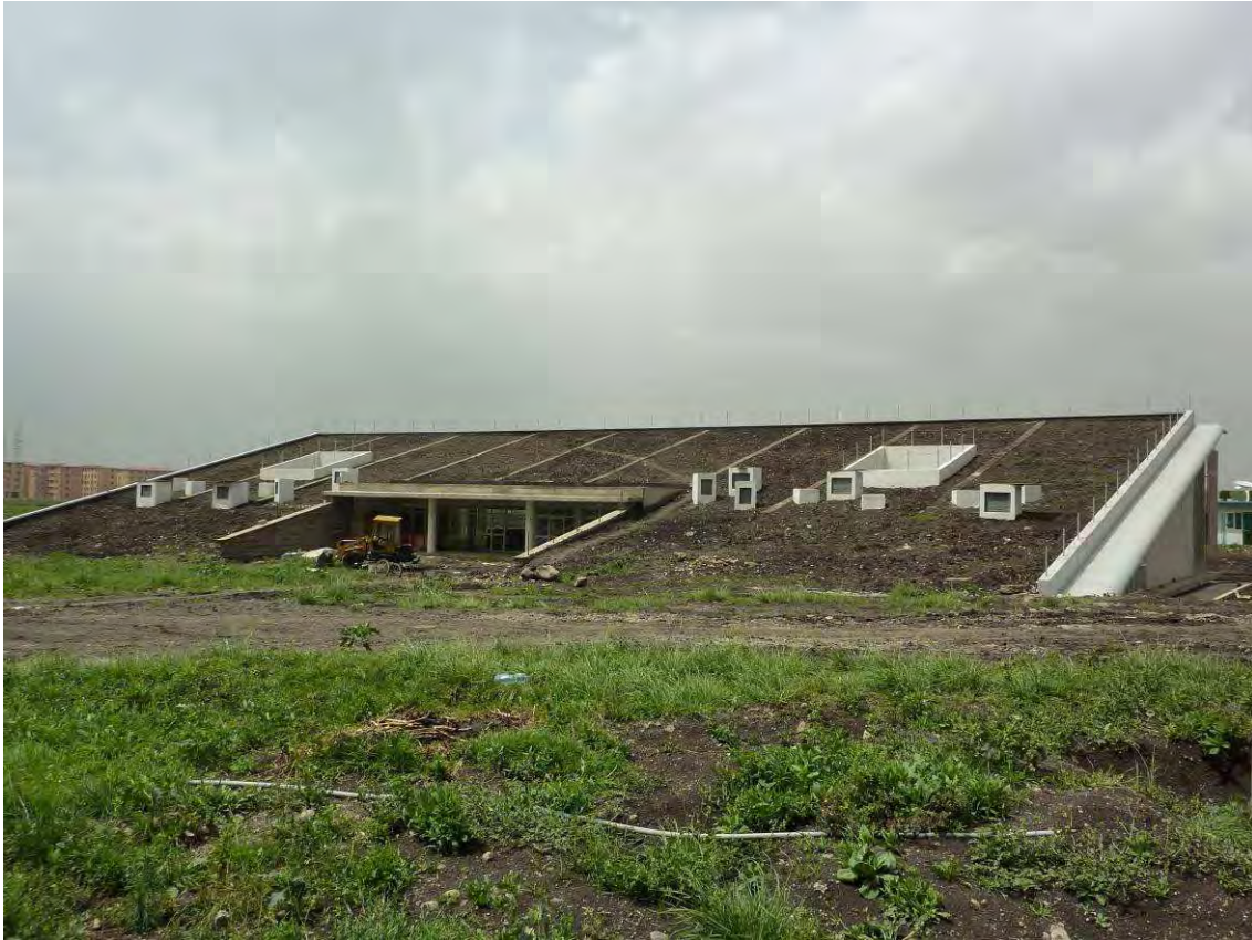
Library landscape roof (K), finished for 90%.