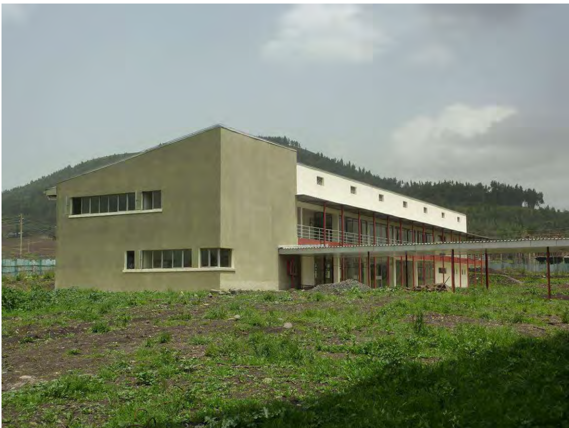
Service Centre (A),finished for 90%.