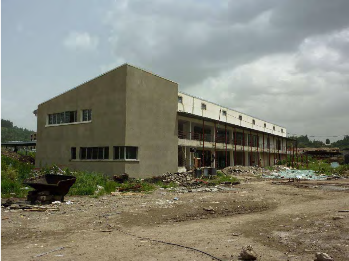
Faculty Office (E), finished for 60%.