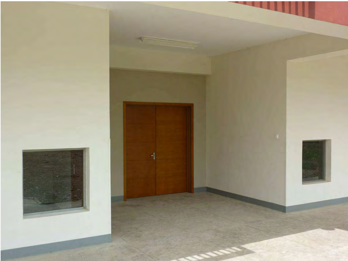
Fragment Classroom building (B), finished for 90%.