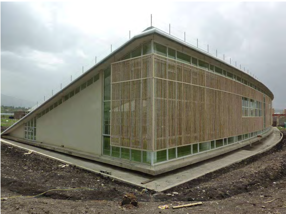
Library (K), finished for 90%