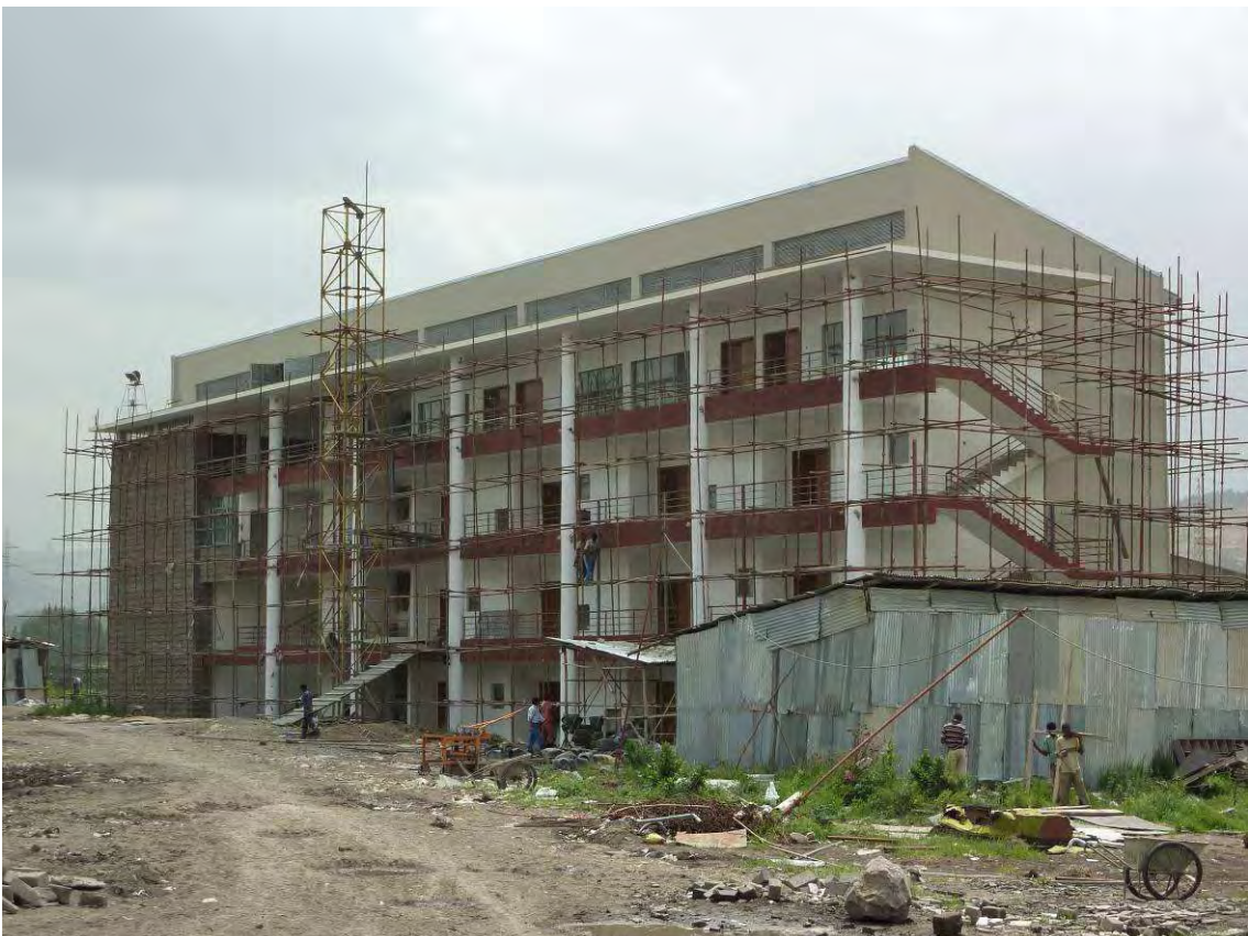
Class room building (H), finished for 60%.