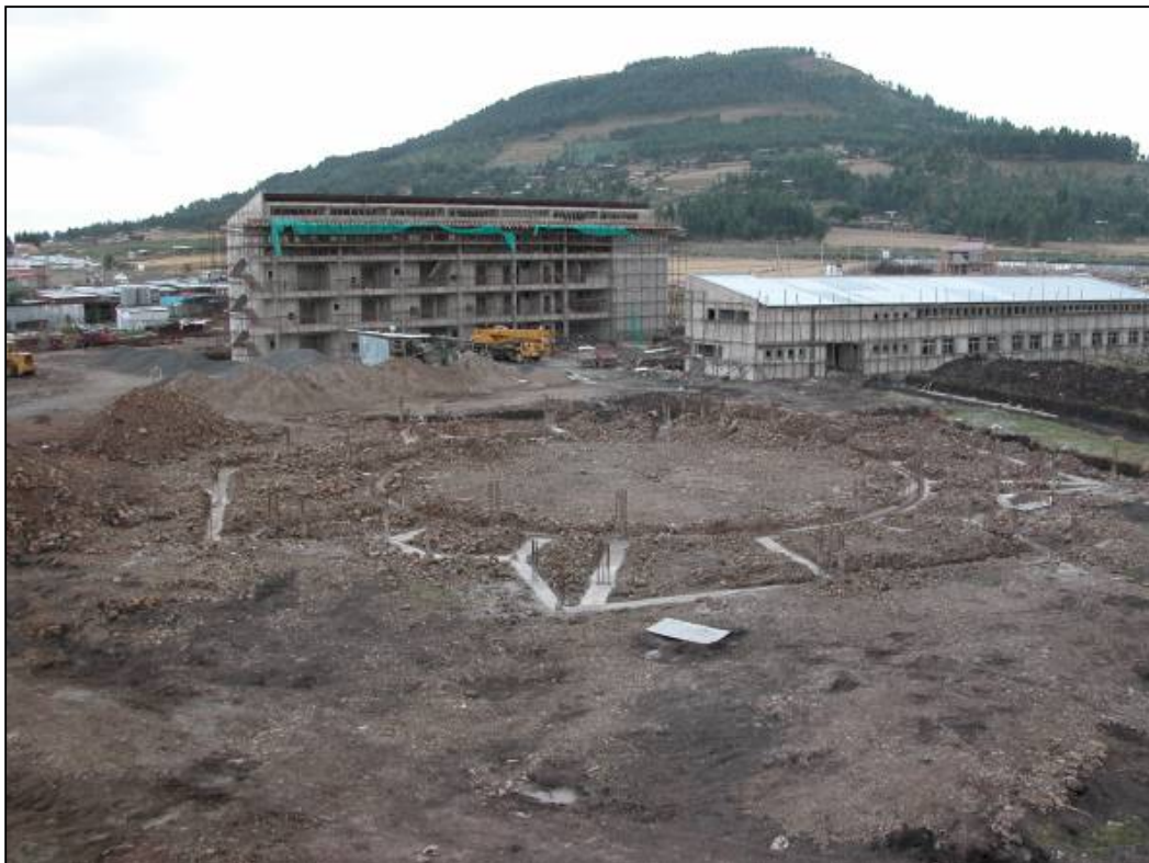
Multi Purpose Hall (D)

The construction of the Multi Purpose Hall has begun and in the foreground the foundation can be seen with in the background Administration and Classroom B.