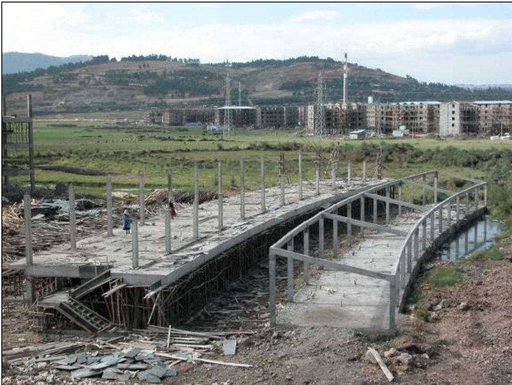
Staff Residence Building (H)

Arbeiders zijn bezig om de spanten voor de corridor te lassen en te schilderen, die de verschillende gebouwen zal verbinden.