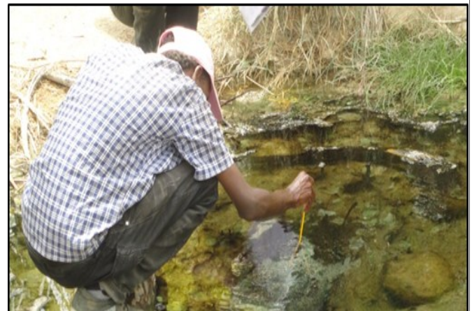
Collecting water quality data in a natural hot spring