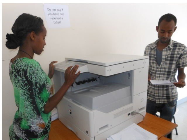
Girls club and their copy center

As we write this newsletter, the second semester classes are ending and preparations for the first graduation are underway.