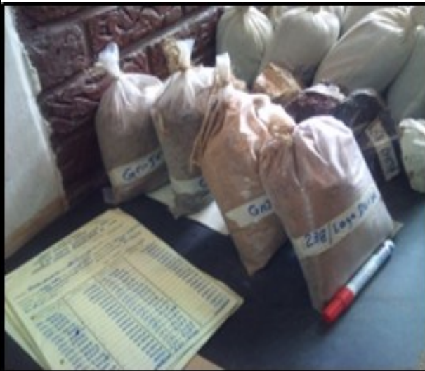
Samples for mineral testing at the Ministry of Mines lab