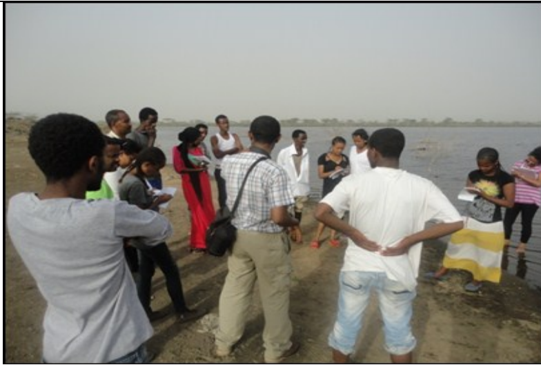
Hydrogeology lecture on the shores of the saline, alkaline and expanding Lake Beseka

-Later in the semester, our students registered for geology course visited the offices and laboratories of the Geologic Survey of Ethiopia, part of the Ministry of Mines; the guide for this visit was a geo-hazards expert who showed students some of the processes of geo-hazard mapping and geologic resource identification.