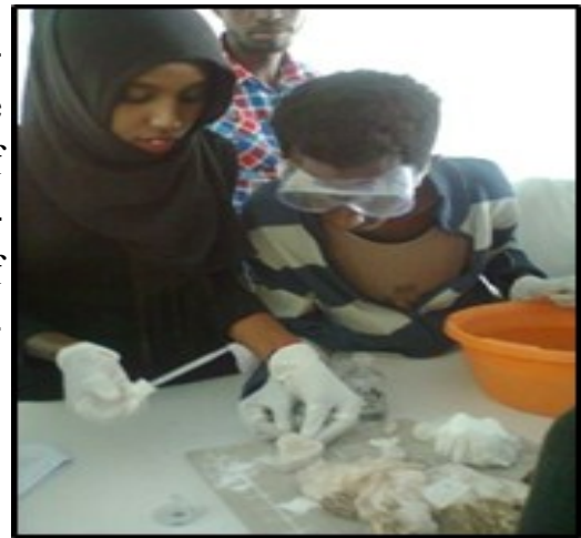
Testing rocks for carbonate minerals at the HUC lab

-Later in the semester, our students registered for geology course visited the offices and laboratories of the Geologic Survey of Ethiopia, part of the Ministry of Mines; the guide for this visit was a geo-hazards expert who showed students some of the processes of geo-hazard mapping and geologic resource identification.