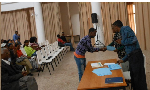
Student's receiving academic award certificate from the Dean of Student and Registrar.

A total of 124 students were recognized for their best academic achievements according to the results of first semester. Sixty two fe-