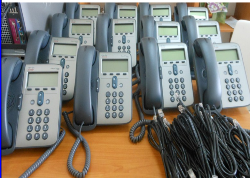
IP telephony ready for distribution

GCS has started installing the IP telephony and WIFI to HUC according to earlier contract agreement. Seven WIFI spots were installed in the classrooms, the library and cafeteria improving the internet connectivity of HUC. IP telephony internal lines were also set up and