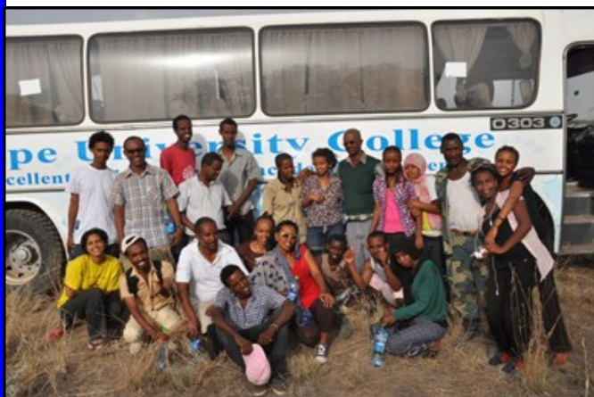
Traveling in the HUC bus to Awash National Park for field work

-Active lab and field sessions were held in Ecology and Geology courses. In our labs and on our campus, students learned techniques in quantitative ecology and rock identification. Subsequently on a field visit to Awash National park, students observed a variety of ecosystems (riparian, bush land and wetland) and a number of landforms and hydro-geologic features produced by both internal and external geomorphological processes (Awash river valley, Mt. Fentale volcano geologic hot springs, the expanding saline Lake Beseka). On the field visit students took water quality readings at the hot spring, lake and river, and they also carried samples back to the lab for further analysis.