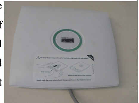
Cisco WiFi installed

the service will soon be operational as soon as the four direct lines requested from Ethio-telecom are made available.