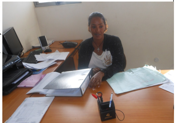
Finance officer at work

HUC for the first time is in possession of cash receipts printed in its own name, thanks to the rigorous efforts by the General Secretary of Hope Enterprises. Thus, issuing receipts for back payments are underway and the finance office is working to clear backlogs soon.